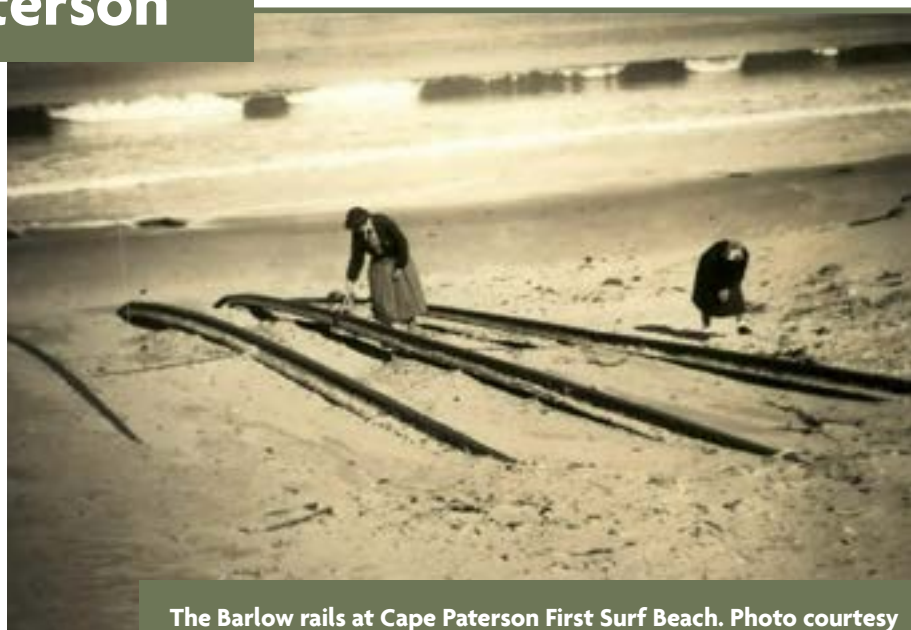
The Barlow rails at Cape Paterson First Surf Beach.

The rails are the oldest relic of coal mining in the Cape Paterson area. They were sourced from the tramway in Geelong, and gifted by the Victorian Government to complete construction of the rail in 1863.