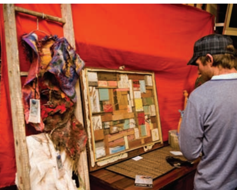
Something Fishy out at the Killy, Creative Gippsland be inspired arts festival, May 2010.