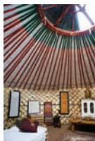
Many Hands Exhibition in the Yurt, Galleria del Mare