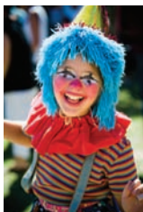
Parade Clown, Wonthaggi Centenary Celebrations