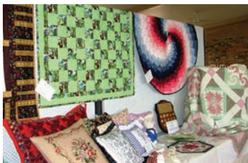
CWA Bass Exhibition

Workshops with guest authors, public readings and festivals. Monthly meetings on the second Monday, 12 noon to 4.00pm, San Remo Hotel. Please call for further information.