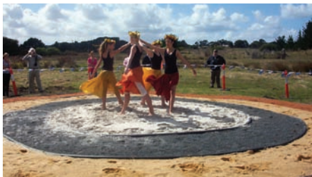
Labyrinth Festival, Bass Coast Ballet, SCM Rescue Station Arts Inc