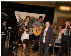
Family Tree , Something Fishy out at Killy, Creative Gippsland be inspired arts festival

Community singing for fun. Practise is usually on a Wednesday. Please call for details.