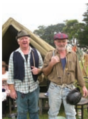
The Miners, Wonthaggi Tent Town Celebrations