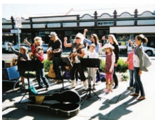
Wonthaggi School of Pop and Rock

Black Diamond Arts Festival, Creative Gippsland be inspired Arts festival, Wonthaggi May 2010