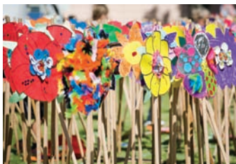
Garden Party Flowers, Wonthaggi Centenary Celebrations

Monthly film screenings last Wednesday of each month.