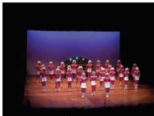
Dance Design, Concert 2009