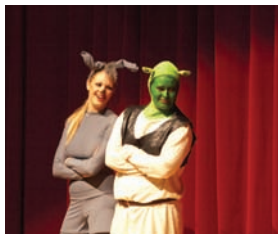
Dance Design, Concert 2009

Jazz, tap and contemporary dance classes. Evening classes at various locations: Wonthaggi – Monday; Cowes – Tuesday and Wednesday; Korumburra – Friday. Pre-schooler classes in Wonthaggi on Monday and Wednesday and Cowes on Tuesday.