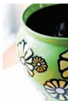
Ceramic , Lynn Whelan, Inveramics