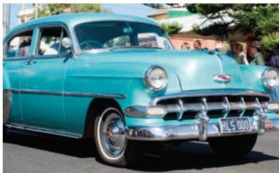
Antique Car, Wonthaggi Centenary Celebrations