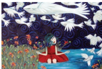
Whale Girl , Fiona Kennedy, Acquired by Bass Coast Shire Council, 2008

Council's collection started in 1990 and includes works by prominent local and some Melbourne artists. To view images of the work go to our website www.basscoast.vic.gov.au .