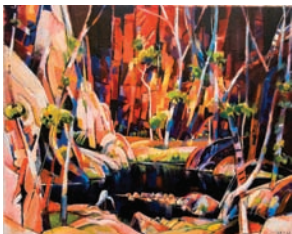
Waterhole, Flinders Ranges