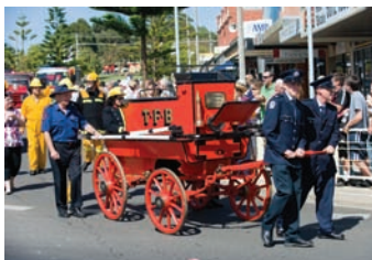
Street Parade, CFA, Wonthaggi Centenary Celebrations

Bass Coast is rich in historical significance and is home to a diverse range of Aboriginal cultural heritage sites. The Bunurong people were among the first in Victoria to make contact with European mariners and explorers. Bass Coast is home to sites of the first white settlement in Victoria. To learn more about this fascinating history visit the following places.