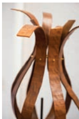
Midi Art Exhibition , Mingara Gallery