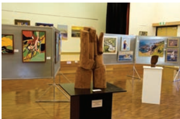
Artists' Society of Phillip Island Exhibition, Easter 2010