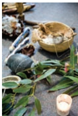
Reconciliation Workshop, Mitchell House, Creative Gippsland be inspired arts festival, May 2010