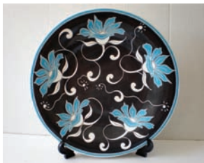
Blue Ceramic Plate , Lynn Whelan, Inveramics