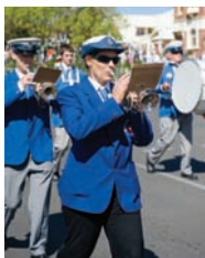
Wonthaggi Citizens Band , Wonthaggi Centenary Celebrations