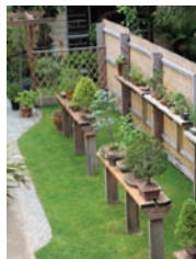
Bonsai Island , Newhaven